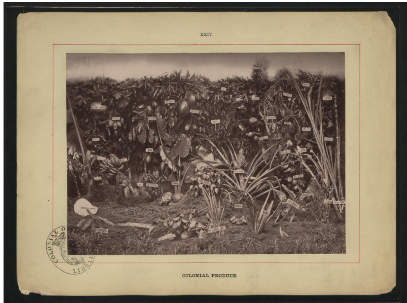
Colonial Produce