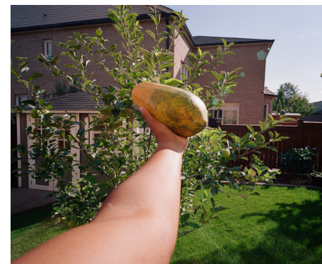
Untitled, WIP, 2023