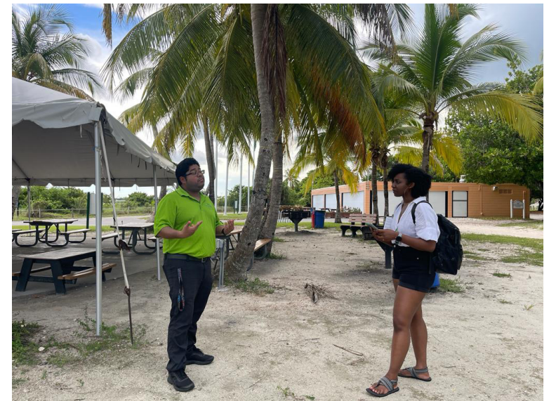
Site Visit Historic Virginia Key Beach