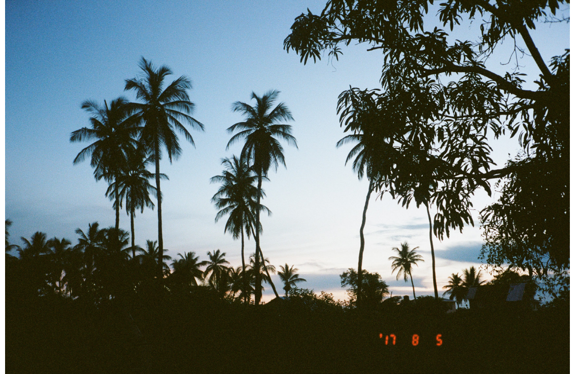
Victoria Village, 2017