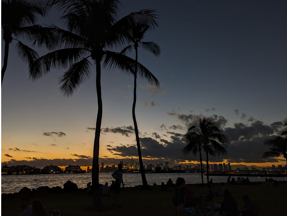
South Beach, 2023