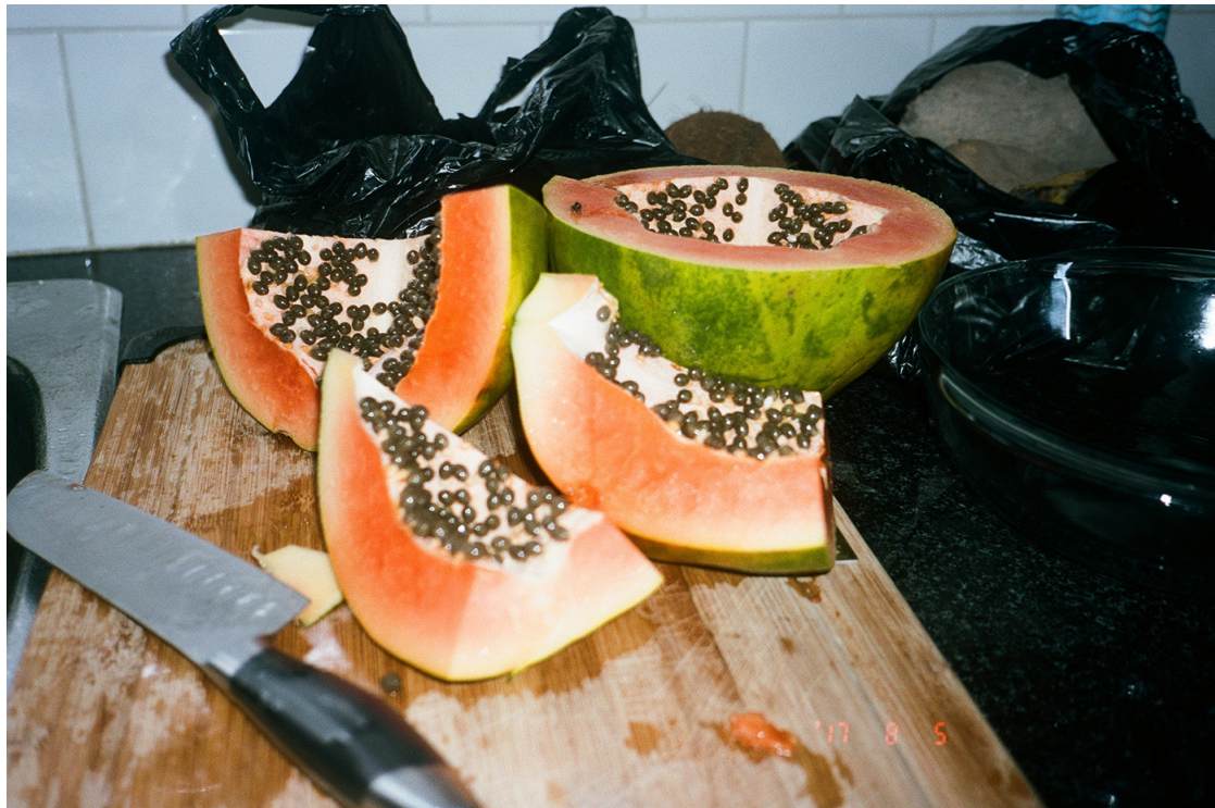
Papaya Dreams, 2017