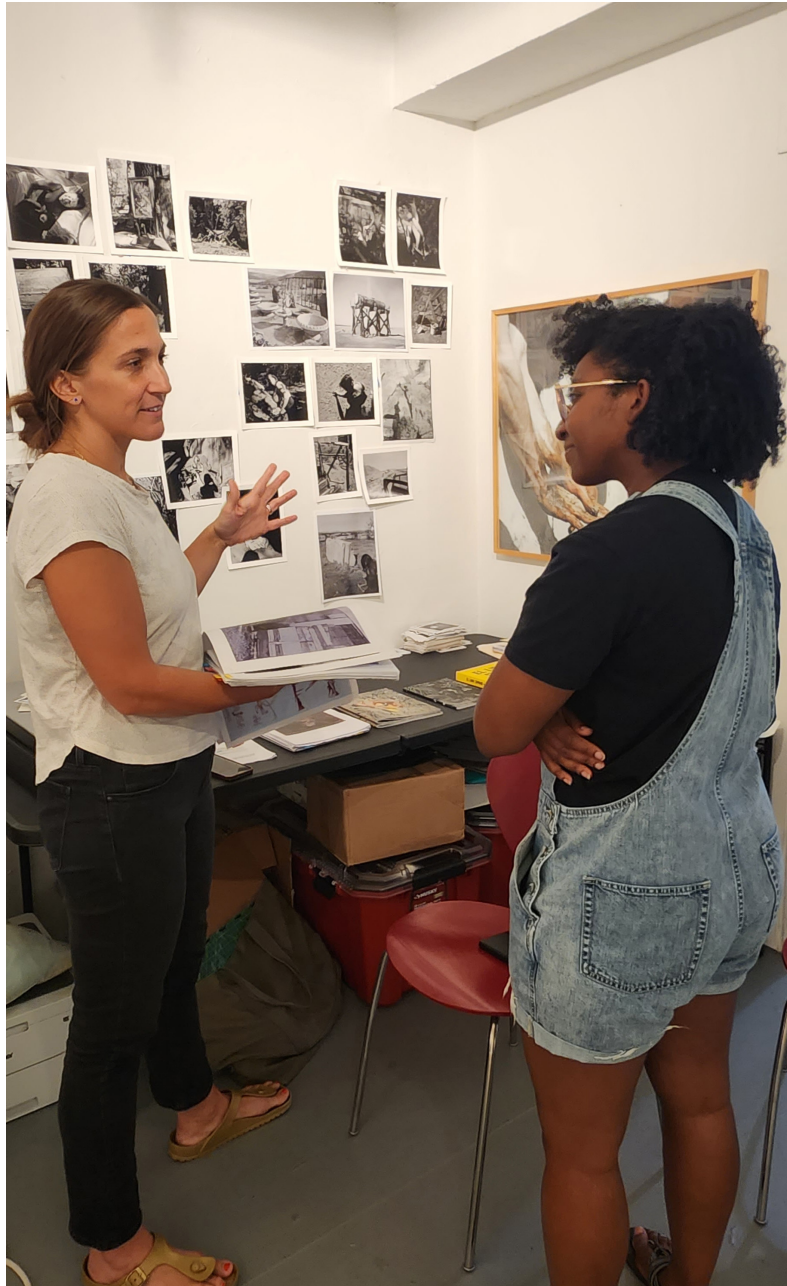
Oolite Arts Studio Visit