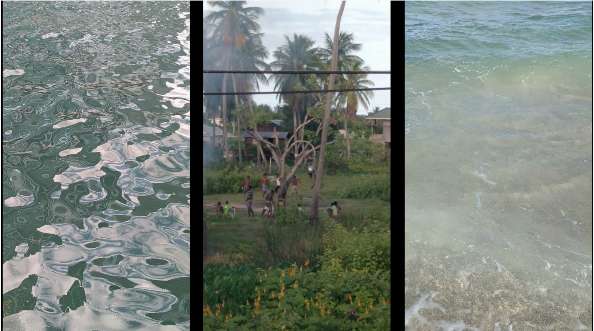
Along the Demerara, About Land, Video Still, 2023