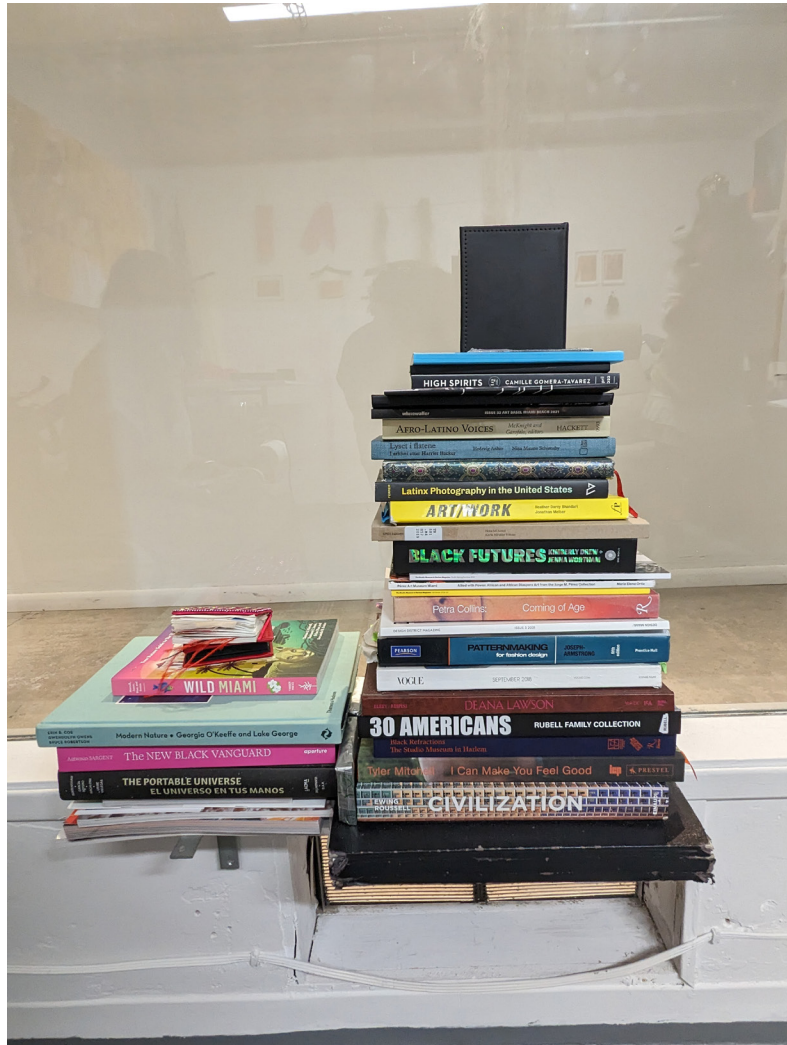
Oolite Arts Studio Visit