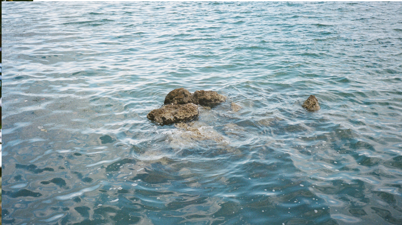
Untitled, WIP, 2023