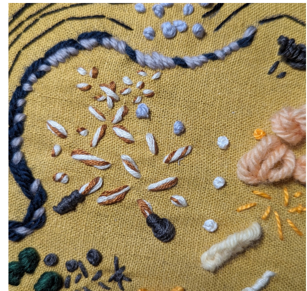
Mark-making Experimentation , WIP, 2023