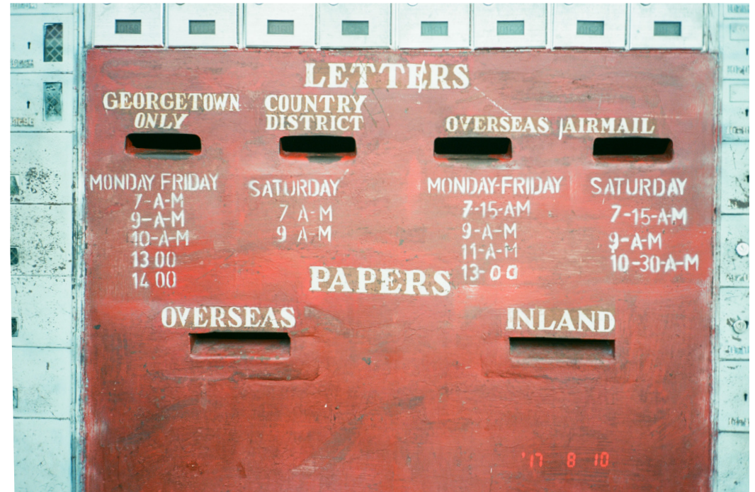
Post Office, Georgetown, Guyana, 2017