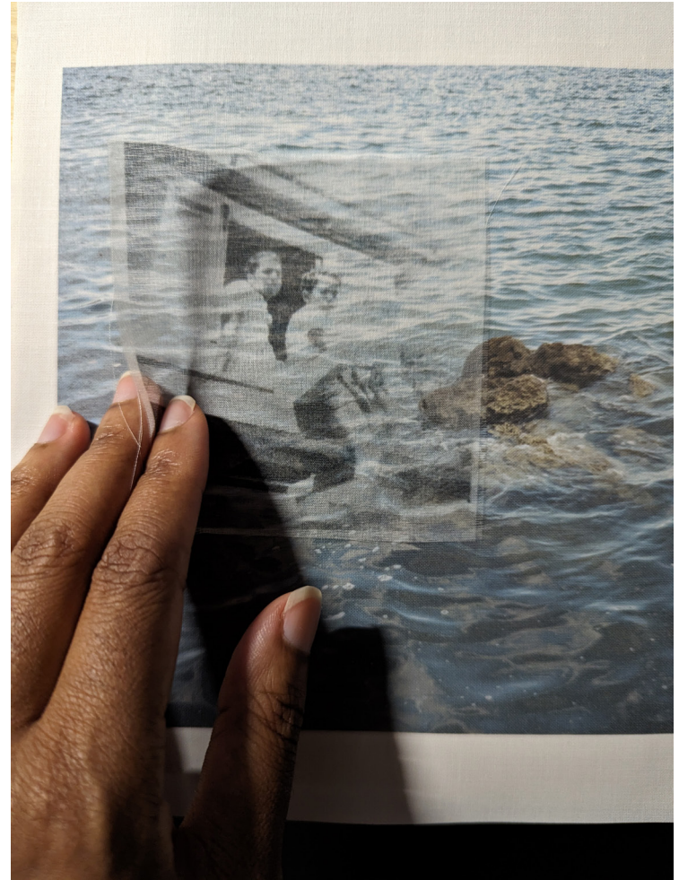
Untitled, WIP, 2023