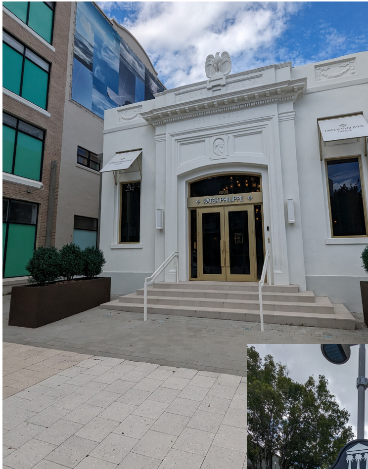
Buena Vista Post Office Moore Furniture Building