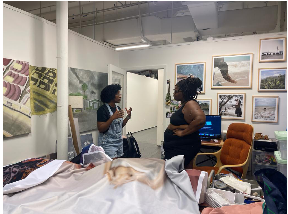
Bakehouse Art Complex Studio Visit