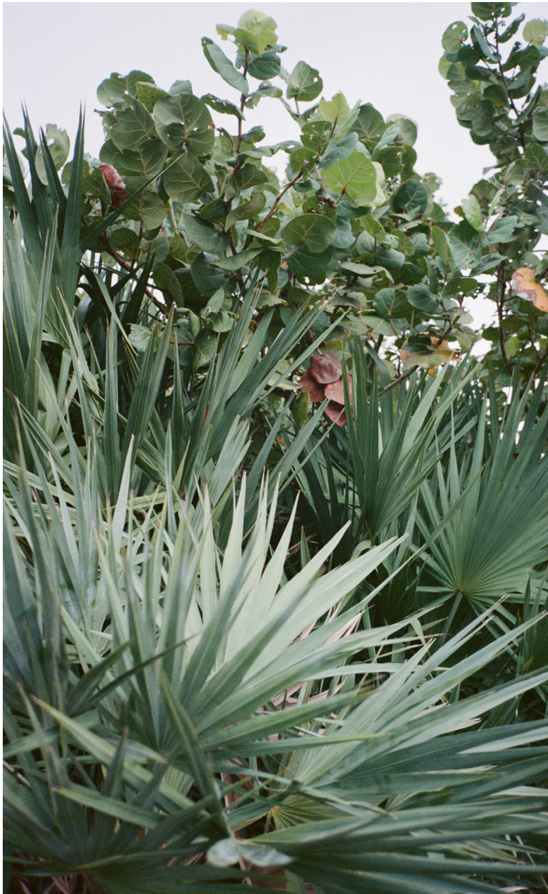
Untitled (Flora, Historic Virginia Key Beach), WIP, 2023